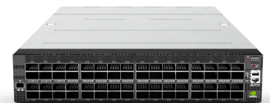
SN5600 switch image