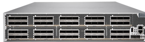
PTX10002 Packet Transport Router