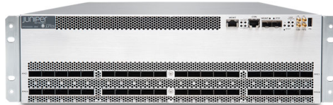
PTX10003-80C Packet Transport Router