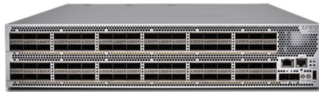
PTX1000 Packet Transport Router