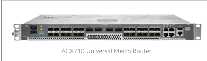
ACX710 Universal Metro Router