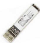
10GBASE-SR and LR SFP+