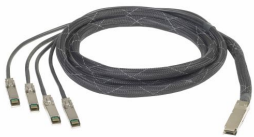
10GBASE-CR: QSFP+ to 4 x SFP+