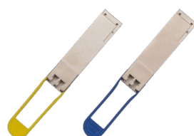
100GBASE-LRL4 and LR4 QSFP