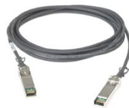
10GBASE-CR Copper Cable

Integrated optics on some products deliver cost effective solutions that are optimized for a choice of interface speed and density in an all-in-one MXP (multi-speed port) interface. The MXP interfaces present standard fiber interfaces and are fully compliant to the relevant IEEE specifications ensuring multi-vendor interoperability as well as the benefits of extended reach and increased reliability.