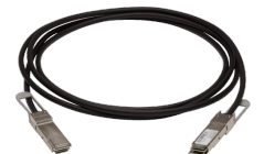
100GBASE-CR4 Copper Cable