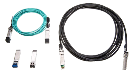
25GBASE-CR, AOC, SR and LR