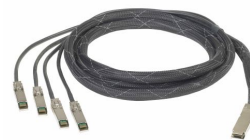
40GBASE-CR4 to 4x 10GBASE-CR Copper Cable