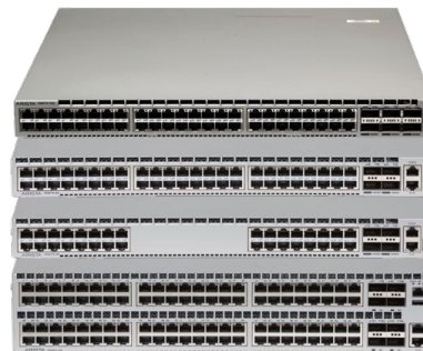
Arista 7050TX Series of 1/10GbE and 10/40GbE Switches Top to bottom: 7050TX-72Q, 7050TX-64, 7050TX-48, 7050TX2-128

All models in the 7050TX Series delivers rich layer 2 and layer 3 features with wire speed performance up to a maximum performance of 2.56Tbps. The Arista 7050TX switches offer low latency and a shared packet buffer pool of up to 16MB that is allocated dynamically to ports that are congested. With typical power consumption of less than 5 watts per 10GbE port the 7050TX Series are power efficient. An optional built-in SSD supports advanced logging, data capture and other services directly on the switch. Combined with Arista EOS the 7050X Series delivers advanced features for big data, cloud, virtualized and traditional data center designs.