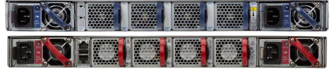
Arista 7050X 1RU Rear View: Rear-to-front airflow model (blue) Front-to-rear airflow (red)